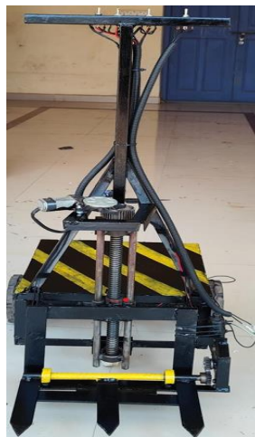
Figure 4: Final assembly front view