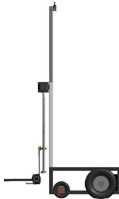
Figure 3: Side View