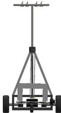
Figure 1: Front View

The side view, displayed in Figure 3, presents the profile of the retractable fork mechanism, including its range of motion. This diagram emphasizes the compact design, which allows the fork to retract seamlessly without interfering with the vehicle's movement.